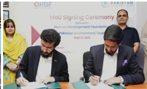
Sept 13, 2023: HDF & PET Sign MoU for a Greener Pakistan.