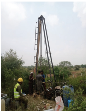
Soil Testing and Boring for Nowshera Healthcare Center.

Significant milestones have been achieved in the construction of the healthcare center in Nowshera, showcasing our commitment to enhancing healthcare accessibility in the region.