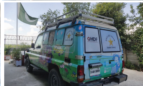
HDF & Bright Star Mobile Library: Promoting Learning at HDF Secondary School, Kalyah, Islamabad