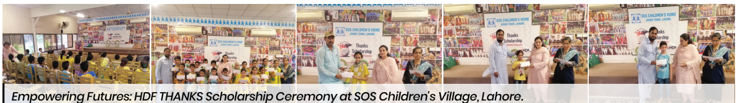
Empowering Futures: HDF THANKS Scholarship Ceremony at SOS Children's Village, Lahore.

These young minds are our future, and HDF continues to empower their dreams.