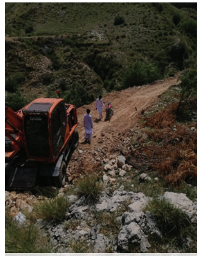
Soon Valley's New Access Road to Afat Dam Under Construction

HDF commends the community for its self-initiative and is honored to have played a pivotal role in their journey towards progress.