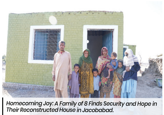
Homecoming Joy: A Family of 8 Finds Security and Hope in Their Reconstructed House in Jacobabad.

The completion of 31 houses in Village Meer Deenar Khan Brohi, Jacobabad provides not only shelter but also a renewed sense of security and stability for the flood-affected population. Families that were once displaced and living in temporary shelters can now look forward to a brighter future with a place, they can call home.