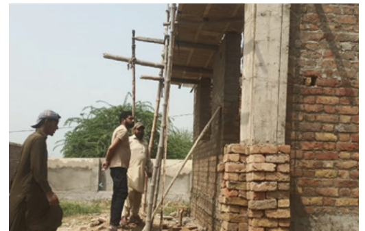
HDF Restoring the Govt. Boys Primary School in Jacobabad..

We are on a mission to revive hope and education for our young generation.