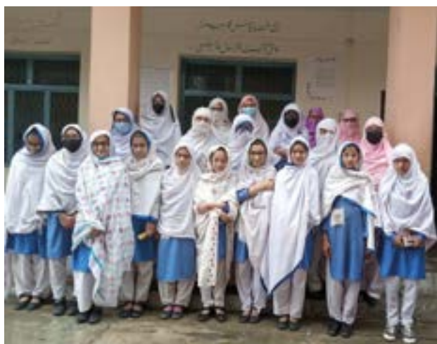
Empowered Girls of Buner Now Breaking Silence on Menstrual Health

HDF launched the 'AGAH Campaign' to address the lack of knowledge and pervasive stigma surrounding MHM as part of the NPI Expand USAID funded project 'Improving access to school health services for children and adolescent girls in Tehsil Gagra, District Buner.'