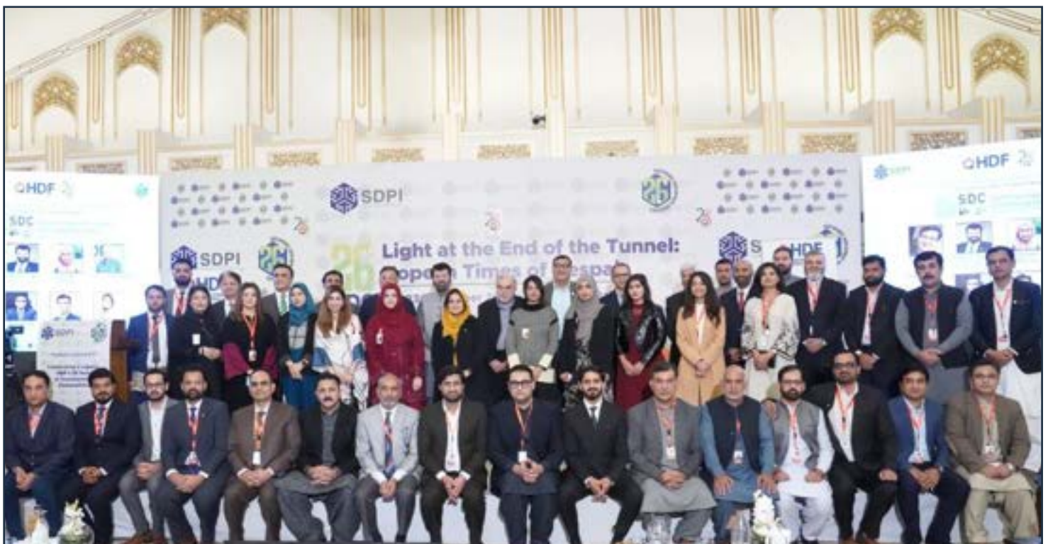
Nov 22, 2023: HDF team gathers to commemorate 25 years of impactful service at SDC2023

The event fostered connections, uniting industry experts, HDF founders, donors, and supporters in their passion for sustainable development. In a significant moment, HDF solidified commitments by signing Memoranda of Understanding with SDPI and Code for Pakistan, paving the way for impactful collaborations toward a greener and more sustainable Pakistan.