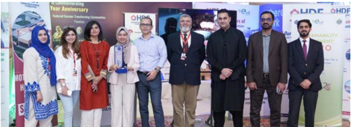
Nov 20, 2023: HDF team gather for a group photo at SIE2023