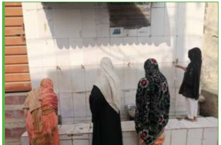
Women gracefully filling water in their pots, embodying empowerment