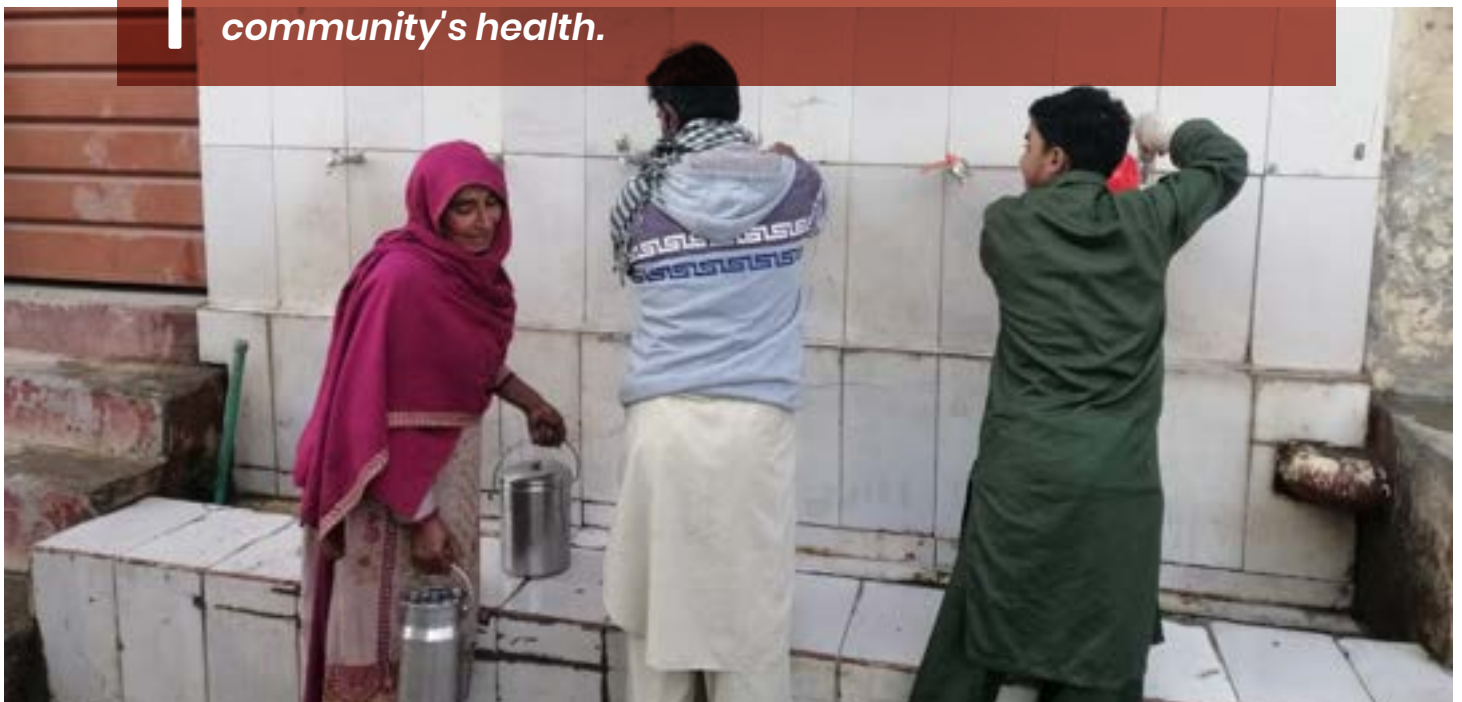
A heartening scene of community members benefitting from the WFP in Karol War

We may be poor, but we look after the water filtration to keep it functional and play our part in preserving our community's health.