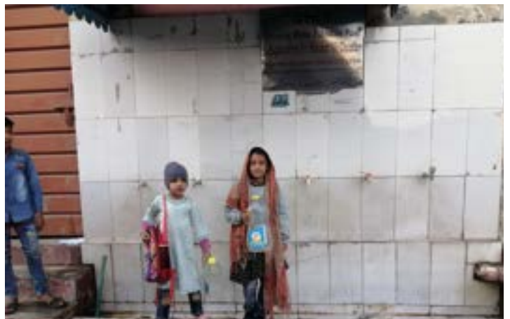
Children proudly holding clean water bottles, symbolizing a healthier future

Imagine the joy in the eyes of villagers who estimate that around 100 households, once spending a minimum of PKR 1000 per month on clean water, are now saving a cumulative PKR 100,000 monthly since the plant's installation. This saved treasure isn't tucked away; it's invested in health, education, and nourishment – a testament to a positive ripple effect that echoes through the community.